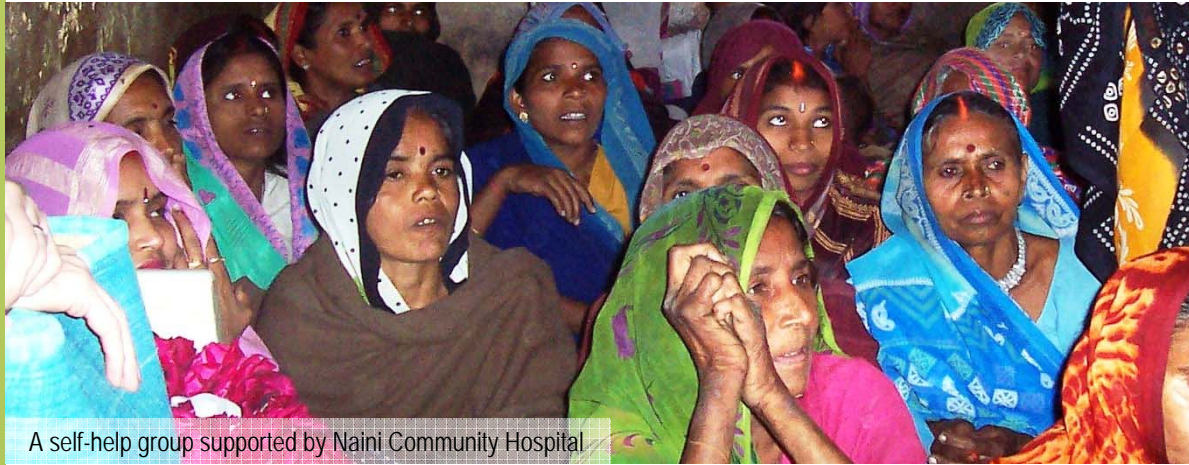
A self-help group supported by Naini Community Hospital