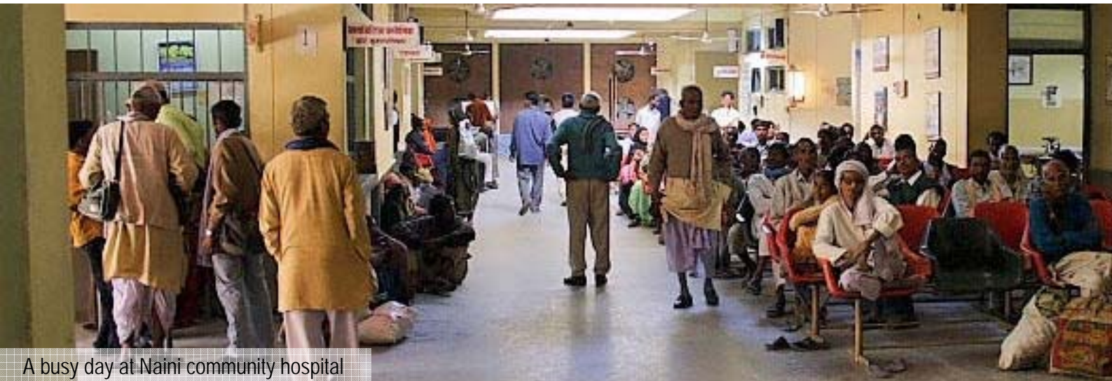
A busy day at Naini community hospital

For more information visit us at www.leprosymission.org.uk