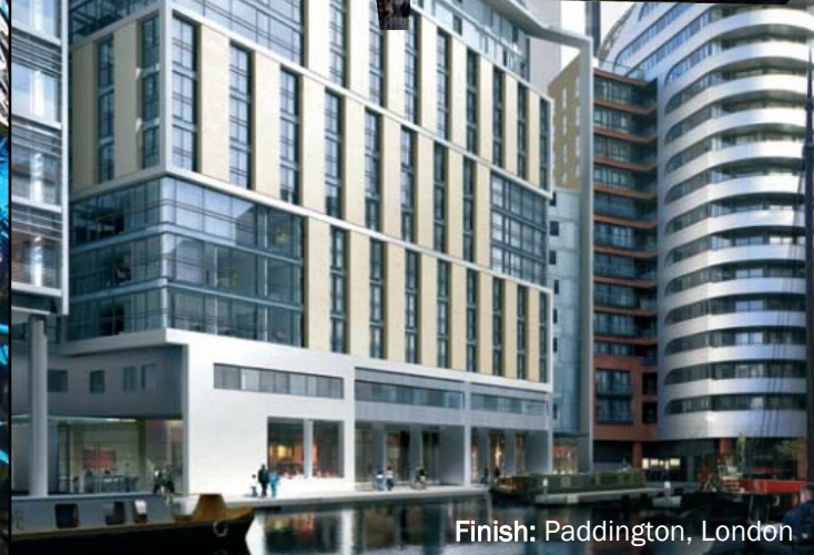
Finish: Paddington, London