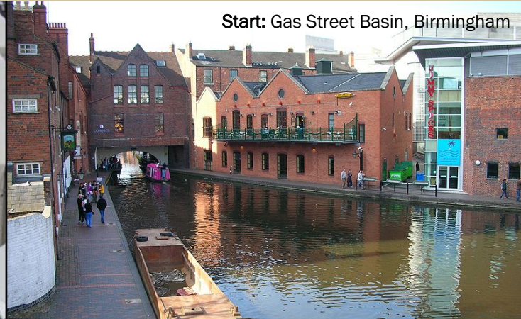
Start: Gas Street Basin, Birmingham