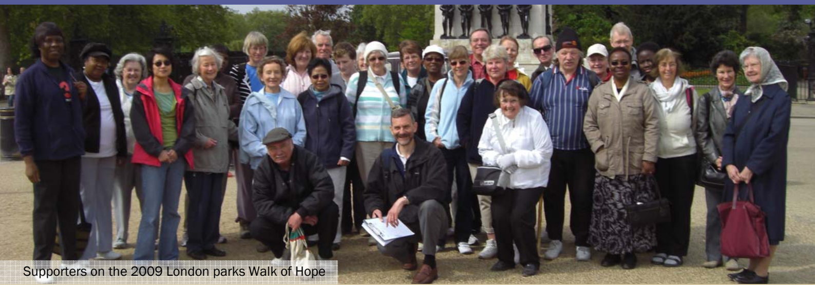
Supporters on the 2009 London parks Walk of Hope

From 22-26 August I'm running along the entire 147 miles of the Grand Union Canal from Birmingham to London to raise support for leprosy-affected people in Nigeria. Please support them by sponsoring me.