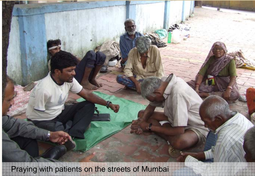
Praying with patients on the streets of Mumbai

'I almost shuddered and yet I was at the same time fascinated. I felt that if ever there was a Christ-like work in the world, it was to go amongst these poor sufferers and bring them the consolation, the hope of the Gospel'.