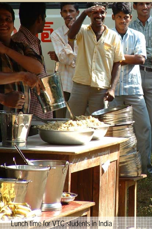
Lunch time for VTC students in India

A great way for everyone to make a difference and change a life!