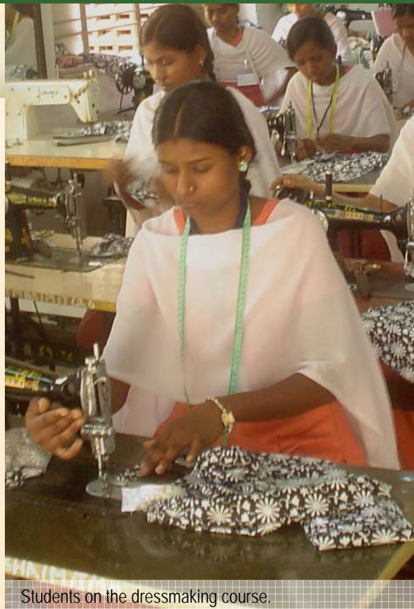
Students on the dressmaking course.

All our events will be supporting the students at Nashik Vocational Training Centre