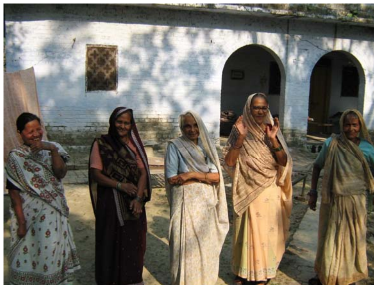
Some of the female residents of Faizabad Mercy Home

Faizabad's Mercy Home - or Snehalaya in the local language - provides long-term residential care for older men and women who are deformed by leprosy and would find it very difficult to live alone. Although cured, these people have often been abandoned by their families and communities because of their disease, but have found a new home for life in Faizabad. Just as important as the practical and medical care given by the mercy home is the companionship and friendship it provides into old age. Residents know they have a safe and secure refuge to the end of their days.