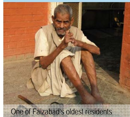
One of Faizabad's oldest residents

Low-cost homes are built for those in greatest need.