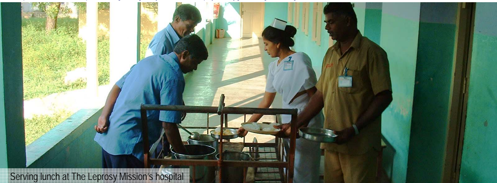
Serving lunch at The Leprosy Mission's hospital

For more information visit us at www.leprosymission.org.uk