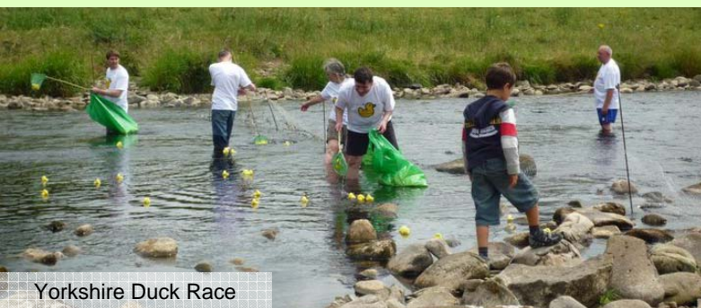
Yorkshire Duck Race

This is a great day out for fellowship and meeting people along the way. Why not get a team together from your church, set yourself a distance target and raise vital life transforming funds for the Mission. Registration fee is £10. Please send in a booking form to enter.