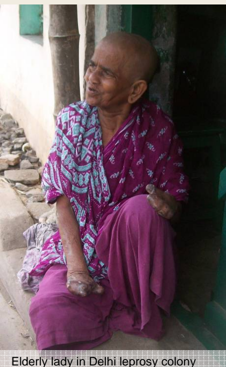
Elderly lady in Delhi leprosy colony

This is exactly what Arun decided to do with his life. So, let's all follow his amazing example and bring joy and hope into people's lives. Let's all help to put a smile back on someone's face and continue to make a difference... TOGETHER.