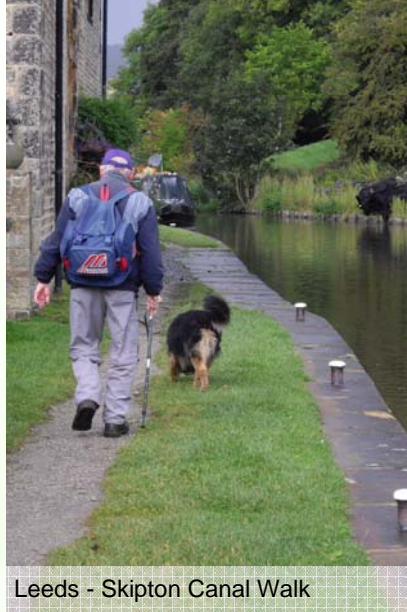
Leeds - Skipton Canal Walk