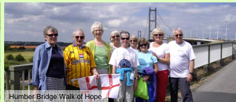
Humber Bridge Walk of Hope

Further information and sponsorship forms can be downloaded from the Yorkshire region page on our website.