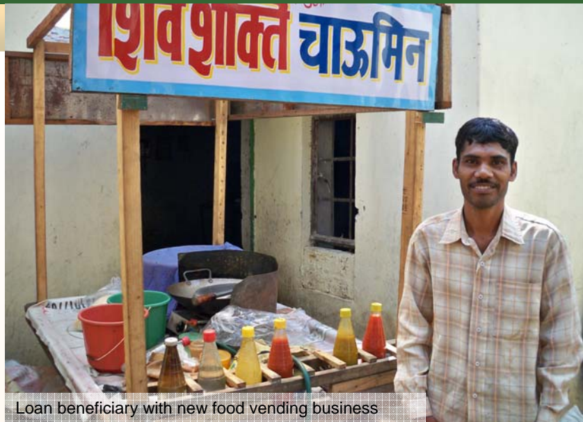
Loan beneficiary with new food vending business