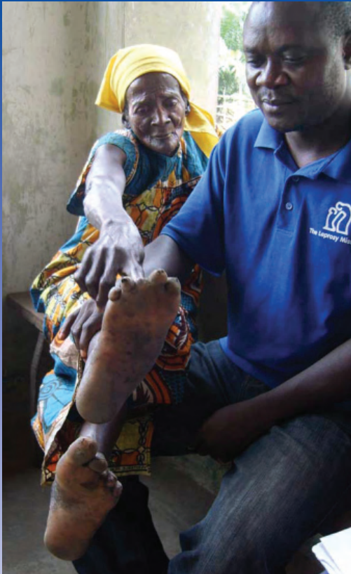
In DR Congo, an elderly woman affected by leprosy seeks treatment for her ulcerated feet (see 10 - 16 April)