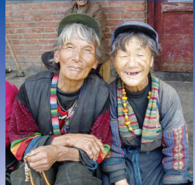
Members of a leprosy community in China, which is benefitting from the Diqing Prefecture Community Rehabilitation project (see 15 - 21 May)

Be joyful in hope, patient in affliction, faithful in prayer.