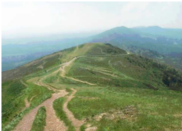
View of the walk across the Malvern Hills

These walks have some of the most stunning scenery in the country. So not only do you get the opportunity to raise money for The Leprosy Mission, you also get stunning views, a good walk and the opportunity to meet some great people. What more could you ask for?