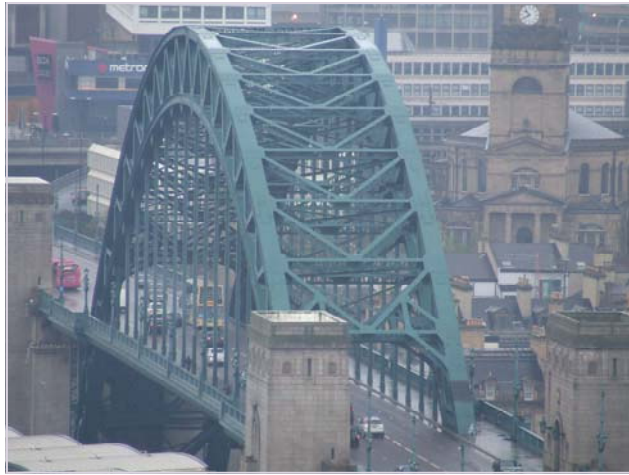
Newcastle's Tyne Bridge, part of the Great North Run

The Great North Run is the world's largest half-marathon race, boasting 50,000 participants. Many people run to raise money for various charities, and The Leprosy Mission has 15 guaranteed places for anyone who wishes to take part and raise as much as they can for our work.