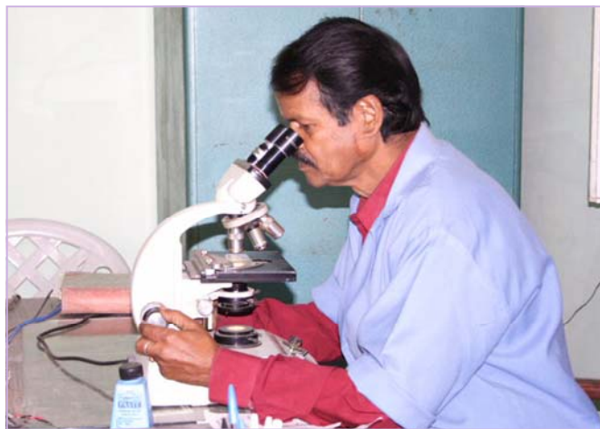
Lab technician examining blood samples in Faizabad

patients mobile quickly and effectively after surgery