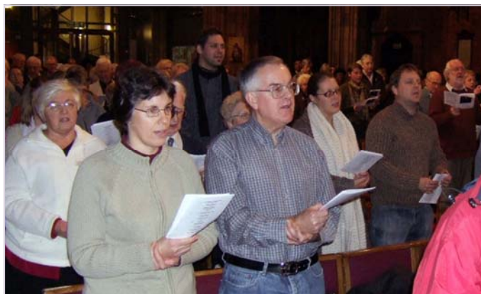
The congregation at All Saints Church

The church's fine acoustics framed each note played by the Birmingham Citadel Band perfectly. From the opening bars of 'Christmas Fanfare' to the closing bars of the march 'The Carollers', the evening was a musical feast. Bandmaster Graham