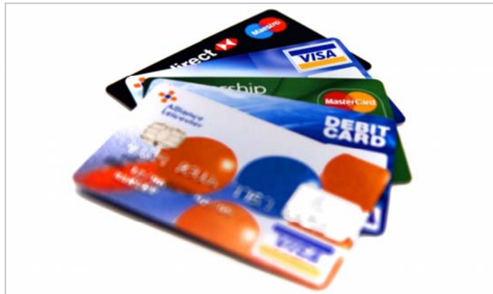
Our big financial institutions are facing darker days

We live in a world whose hunger for earthly wealth is never satisfied. Jesus tells us not to 'store up for [ourselves] treasures on earth' (Matt 6: 19), with all the worries and fears that are associated with