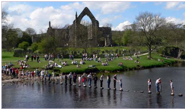
Pilgrimage to Bolton Abbey (20 June)

I have had such a friendly reception to my new post from all my colleagues and of course from you, our faithful supporters. A big thank you goes out to those people who have welcomed me so warmly during my first days travelling around Yorkshire. I look forward to meeting